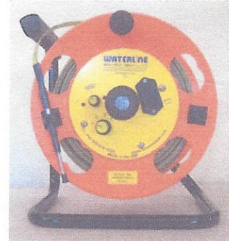
Our standard reel

Free standing durable plastic reel in various sizes with central brake system on strong metal frame. 1000 foot and larger sizes have metal reel.